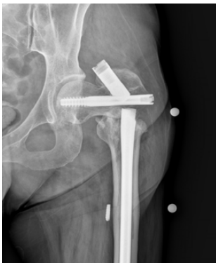
Figure 1. Proximal femur nonunion with hardware failure.