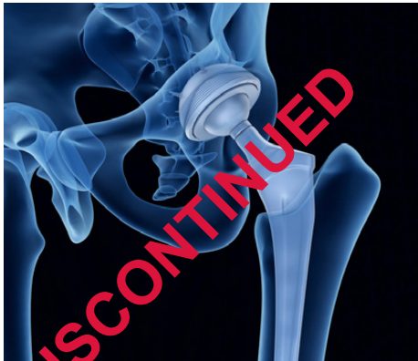
Figure 1. Total hip arthroplasty

Referral considerations for physicians treating patients with high BMI who require arthroplasty Dr. Bedard indicates multiple options exist for physicians to help patients with a high BMI become ready for a TKA or THA. Community physicians should apply similar pre-surgical optimization strategies as those employed by Mayo Clinic. If a physician does not have access to resources to help optimize patients, one option to consider is referring the patient to Mayo Clinic.