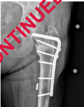
Figure 2. Repair of left proximal femur nonunion with hardware failure.