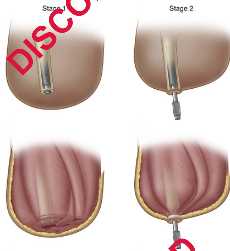
Figure. The process of osseointegration in stages for patients with short residual limbs post-amputation.

Dr. Wilke is excited about what osseointegration provides for eligible patients.