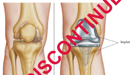
Figure 1. Arthritic knee and repair with total knee arthroplasty.